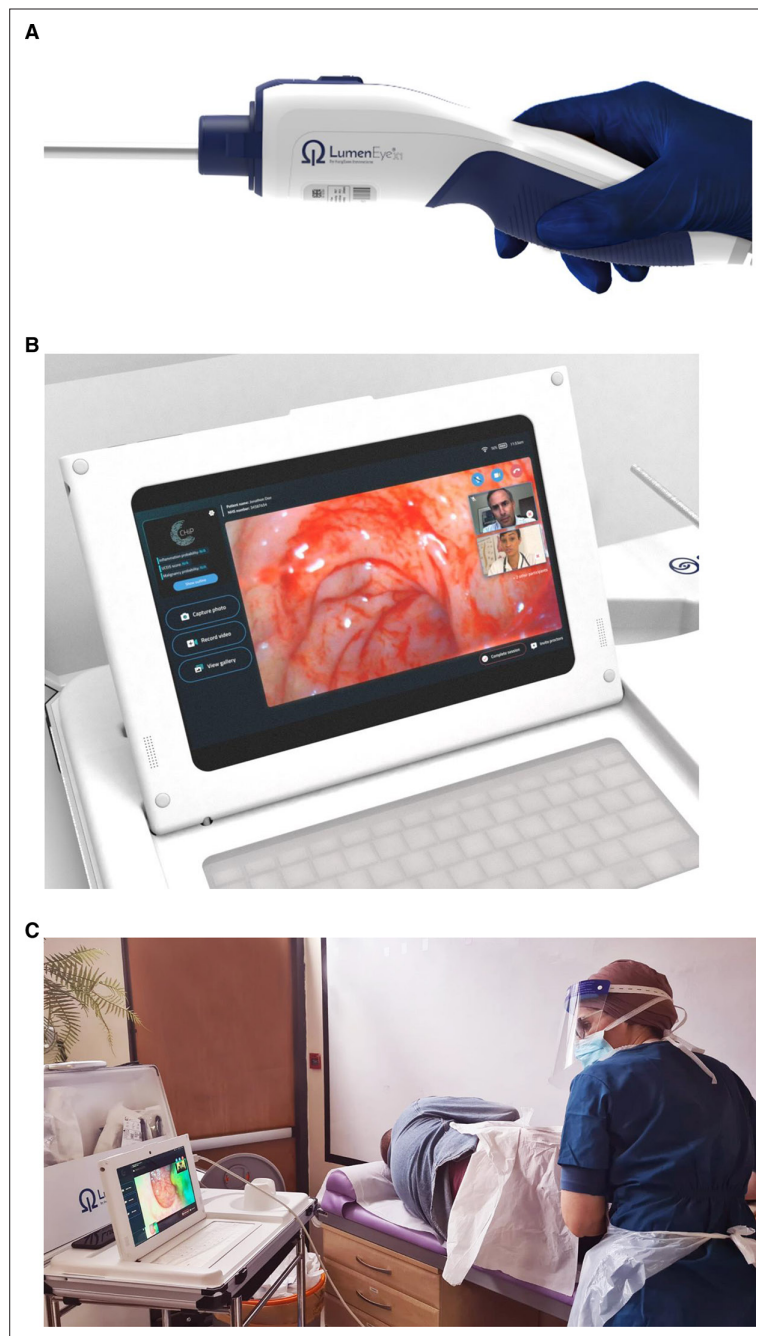
Figure 1 The LumenEye system

A - The LumenEye® device without its disposable plastic sleeve. The disposable plastic sleeve is graduated to 15cm and includes a 3mm working channel to accommodate endoscopic instruments. The handle contains an air insufflator bellows (blue) allowing single handed use.