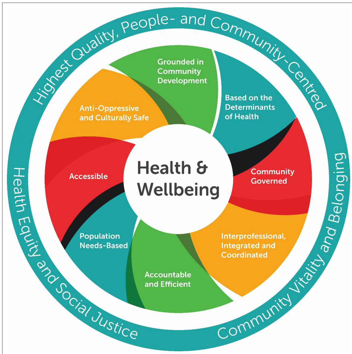
Figure 2 The Alliance for Healthier Communities' Model of Health and Wellbeing.

theoretical framework to design and study interventions that sustain behaviour changes, 17-21 and to study the impact of programmes, including SP. 10,22