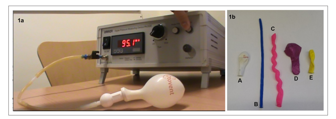
Figure 1 Test equipment used in the study. (Figure 1a) Omron PA350e blood pressure monitor used to test the maximum pressure achieved by each balloon, connecting tubes, nosepiece, and Otovent balloon. (Figure 1b) Balloons tested, left to right: Otovent (A), modelling (B), spiral (C), sphere 1 (D), sphere 2 (E)

As the balloon inflated, the pressure within rose until a critical point when the volume of air within the balloon continued to increase but the pressure decreased. After the maximum pressure had been reached by each balloon (shown by a decline in pressure despite an increase in volume) the machine was turned off, allowing the balloon to deflate. This process was repeated 20 times unless the balloon